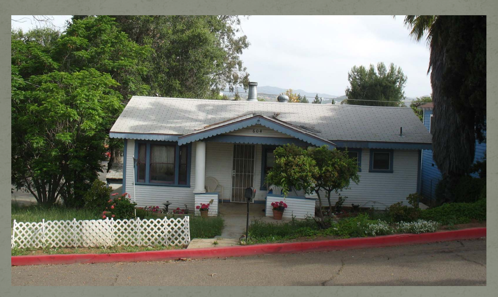
1908 Craftsman Bungalow 604 E. 5<sup>th</sup> Avenue