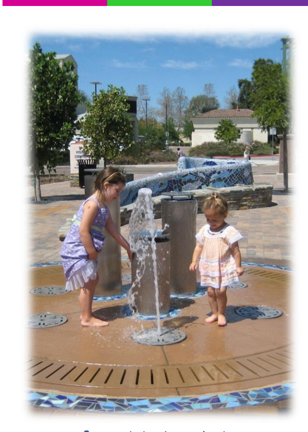
Self-Guided Public Art Walking Tour

Visit public art in Escondido and enjoy a unique shopping, dining and entertainment experience!