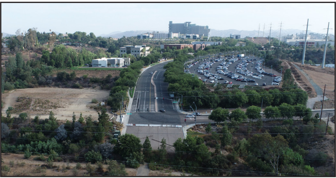
Citracado Parkway, Current Configuration North End at Andreasen Drive

Citracado Parkway, between West Valley Parkway to Andreasen Drive.