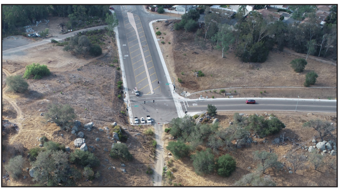
Citracado Parkway, Current Configuration South End at Harmony Grove Village Parkway