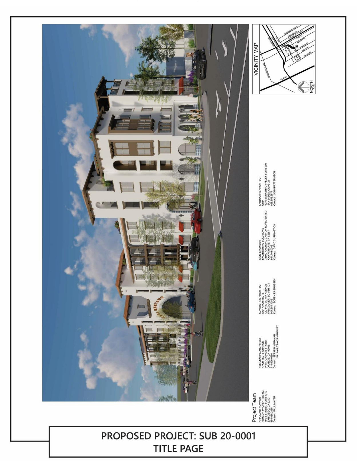
EXHIBIT "D" SUB 20-0001, PHG 20-0009, and ENV 20-0001