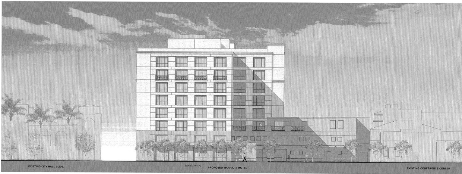
1 NORTH ELEVATION 3/32" = 1'-0"