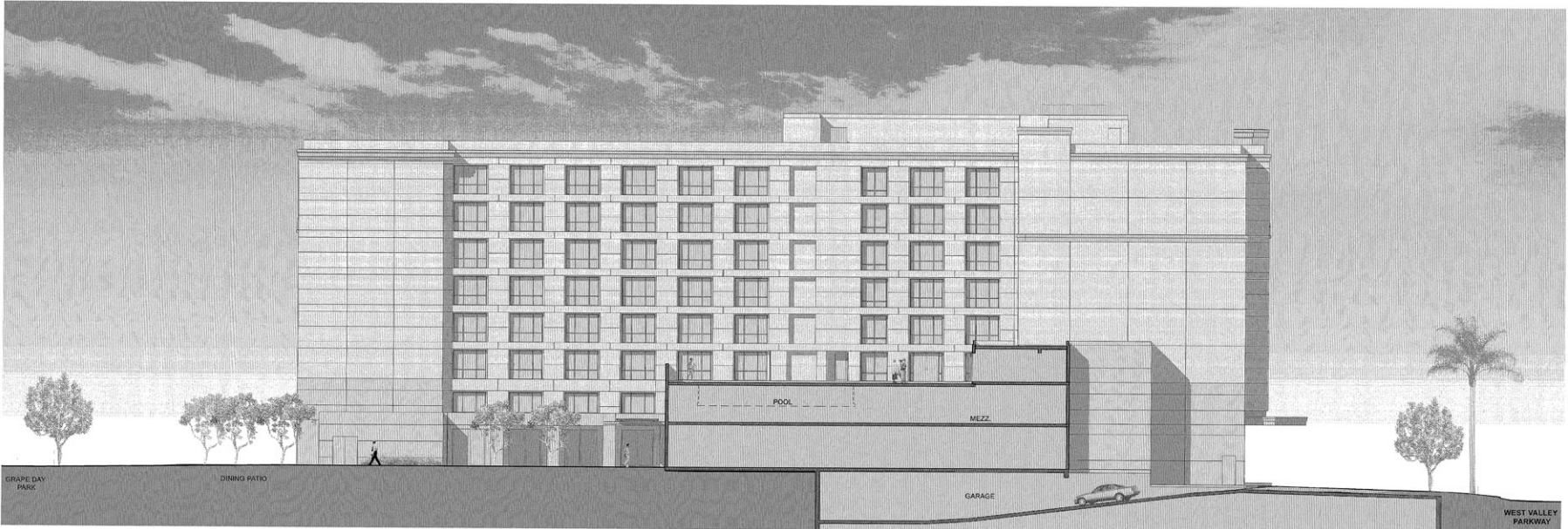
2 WEST ELEVATION 3/32" = 1'-0"