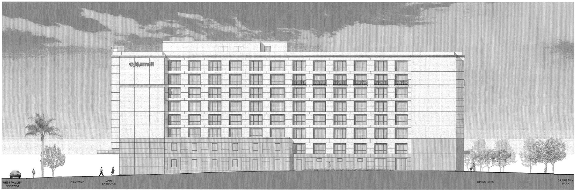
2 EAST ELEVATION 3/32" = 1'-0"