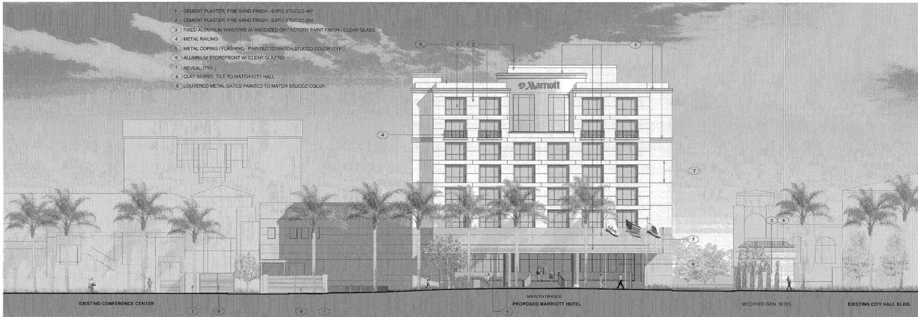
1 SOUTH ELEVATION 3/32" = 1'-0"