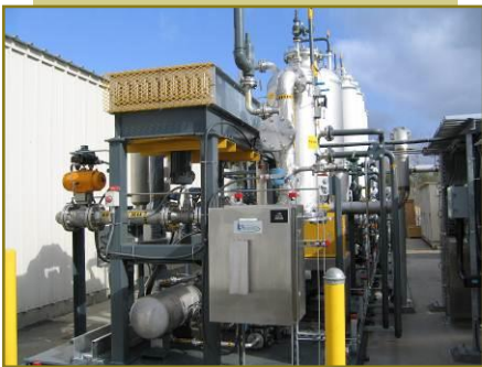
Escondido wastewater treatment facility installed California's first "green technology" that converts raw sewage gas into renewable natural gas, clean enough for use in homes and businesses

Opportunity exists in recruiting higher wage jobs in areas such as bio-tech, bio-med, telecommunications, software, and "green" industries. Attracting technology and life-science related industries to Escondido can create desirable jobs for local residents, resulting in higher per capita incomes; more discretionary income to spend on local goods and services generating more local tax revenues for public services; and more income to invest in local improvements and amenities. This, in turn, will help to continue raising the community's overall standard of living.